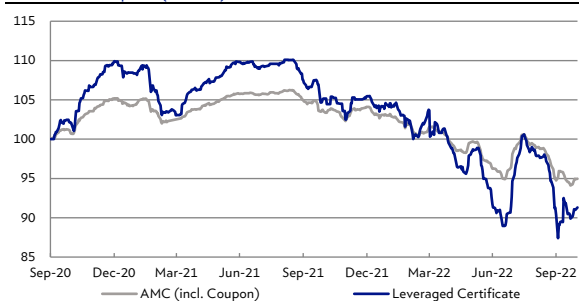
Chart Since Inception (vs AMC)